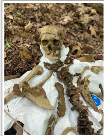
Crime Scene Identification

The investigators will be instructed on procedures and handling of the homicide scene. Evidence identification and collection as well as crime scene mapping, sketching and forensic photography. In addition, the investigators will be working with the Medical Examiner and understanding the procedures of handling bodies and the postmortem examination.